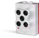
MicaSense RedEdge-MX Industry-leading multispectral sensor