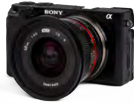
Oblique Sony a6100 3D mapping camera