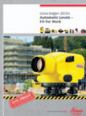
Leica Jogger Automatic levels – Fit for Work

Ask your local Leica Geosystems dealer for more information about our TQM program.