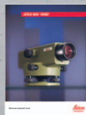
Leica NA2/NAK2 The classical, high-precision level