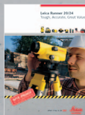
Leica Runner 20/24 Robust and value-priced automatic levels