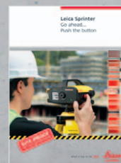
Leica Sprinter One-button digital level